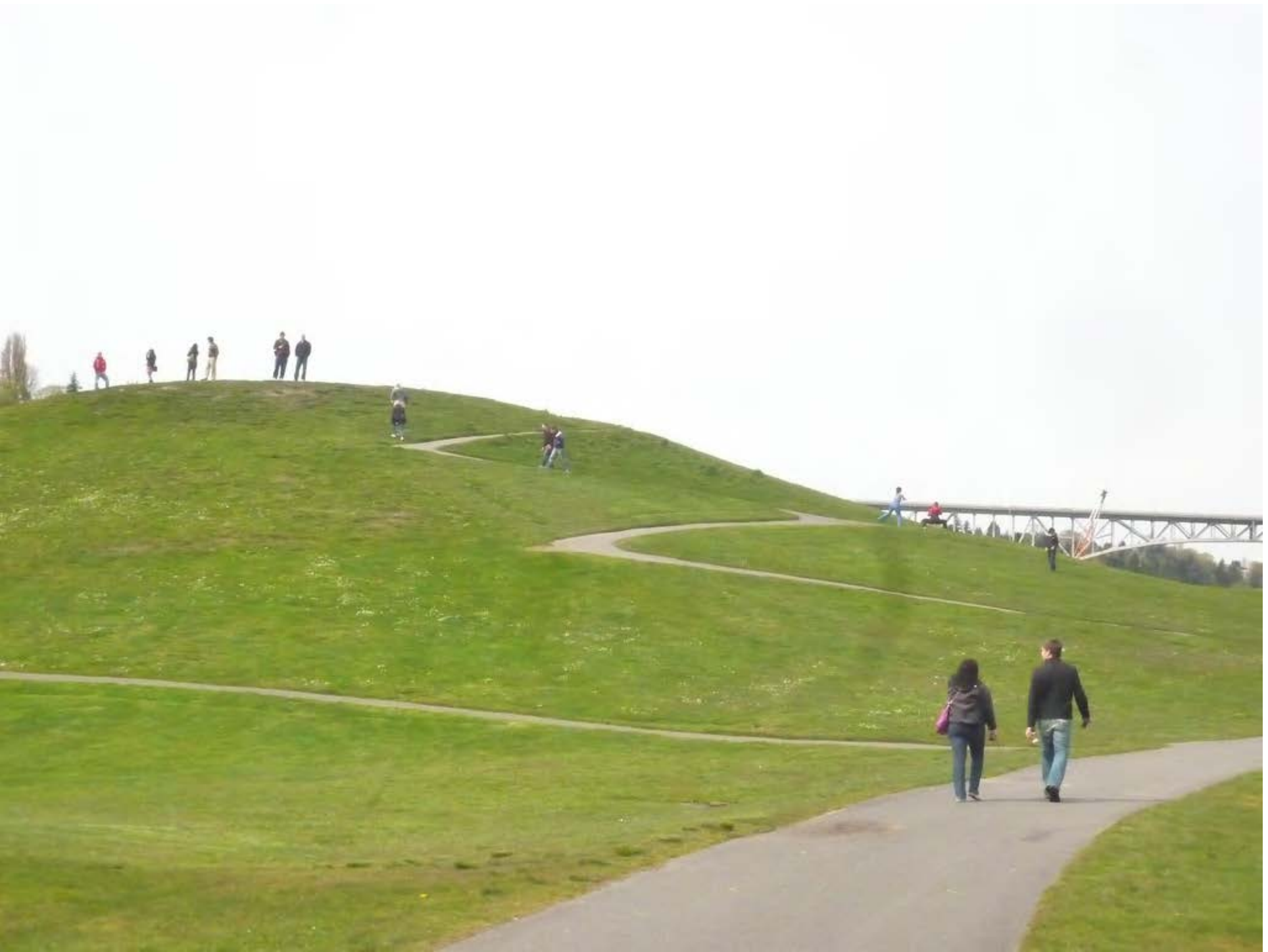
EARTHEN MOUND AND BERMS