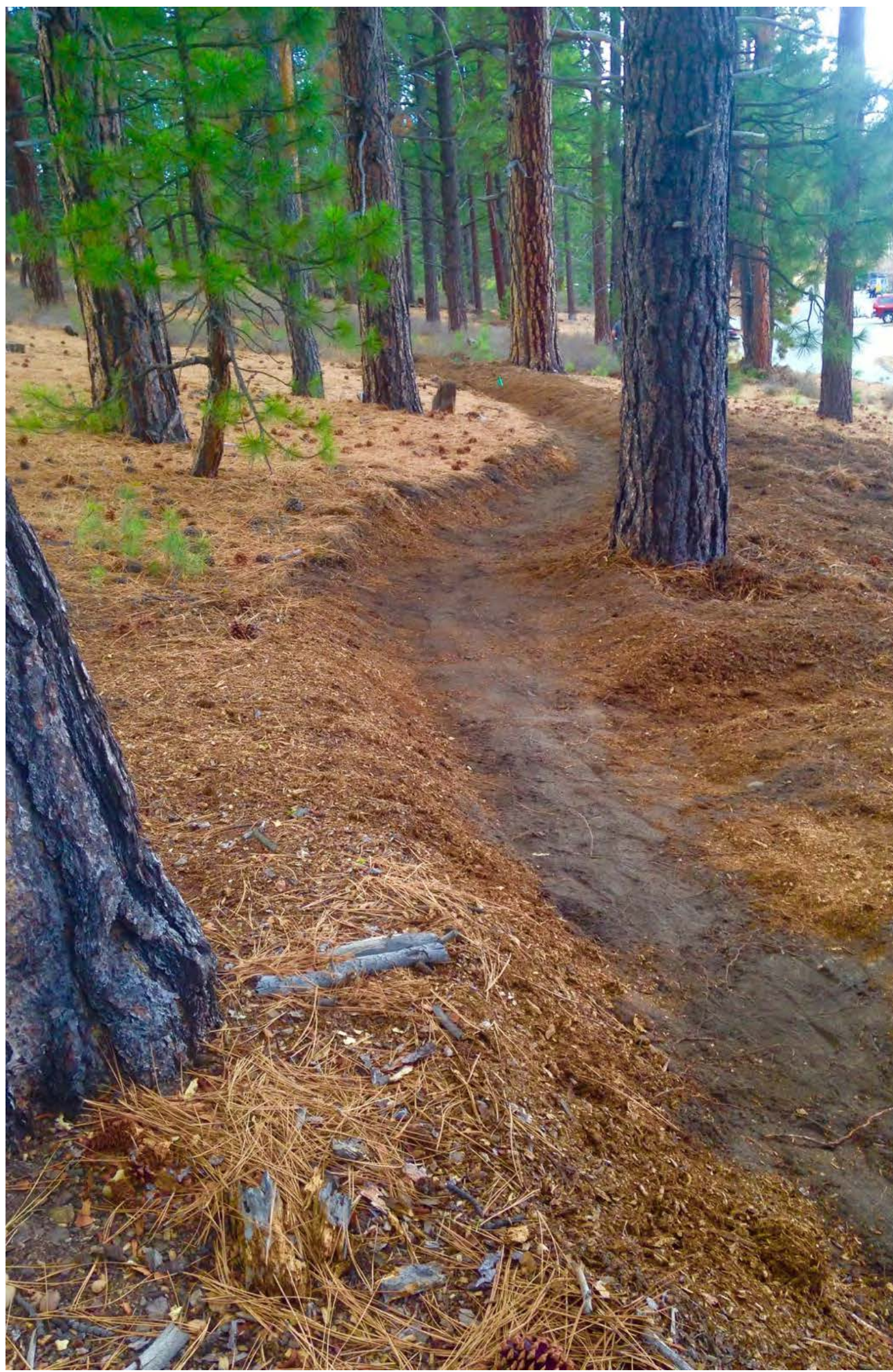
FLOW TRAIL AND PUMP TRACK