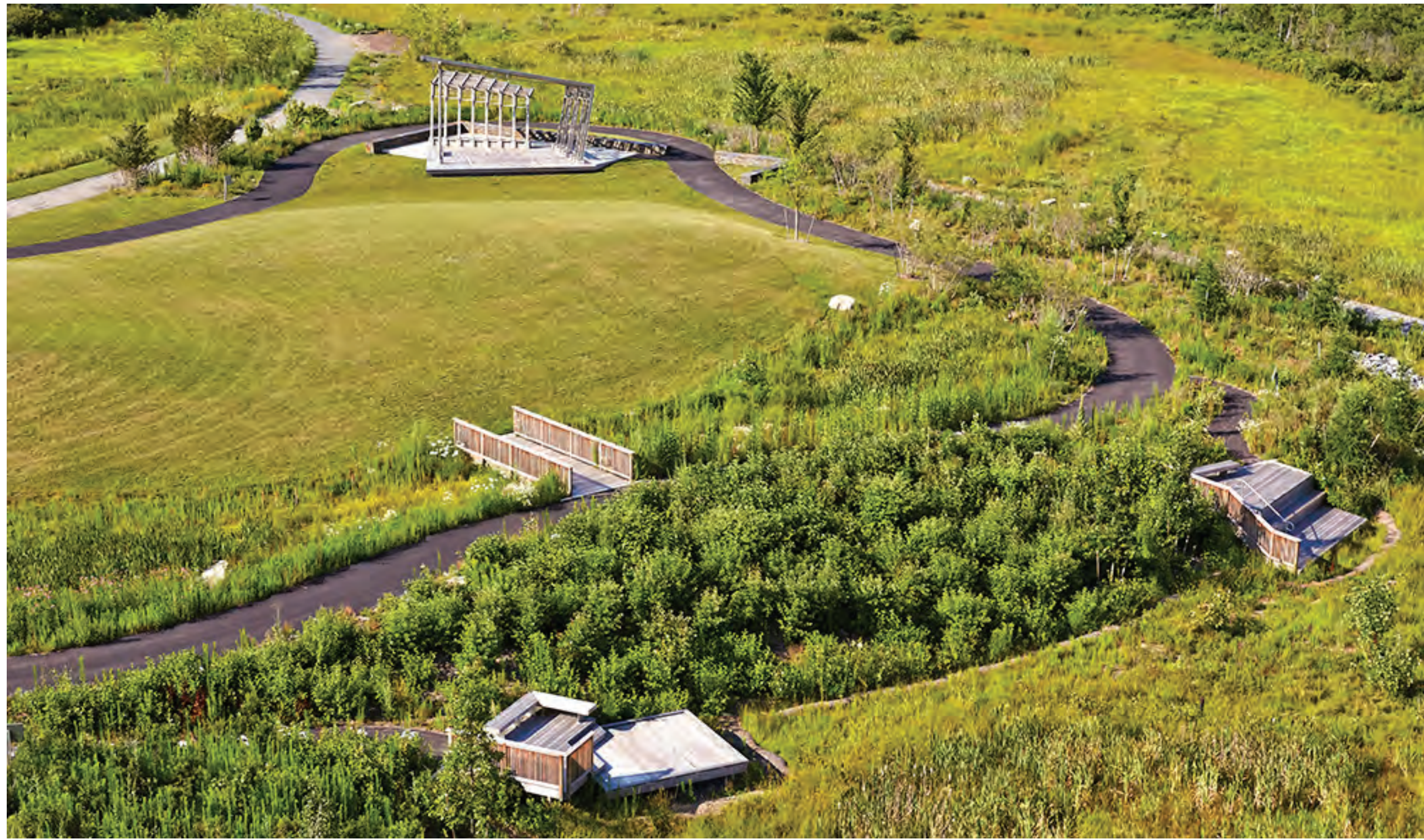
BRIDGE OVER WETLAND AND PARKING BIO-SWALE