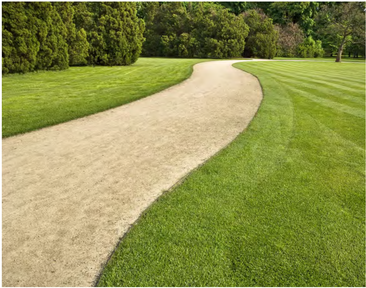
TRAILS AND WALKWAYS